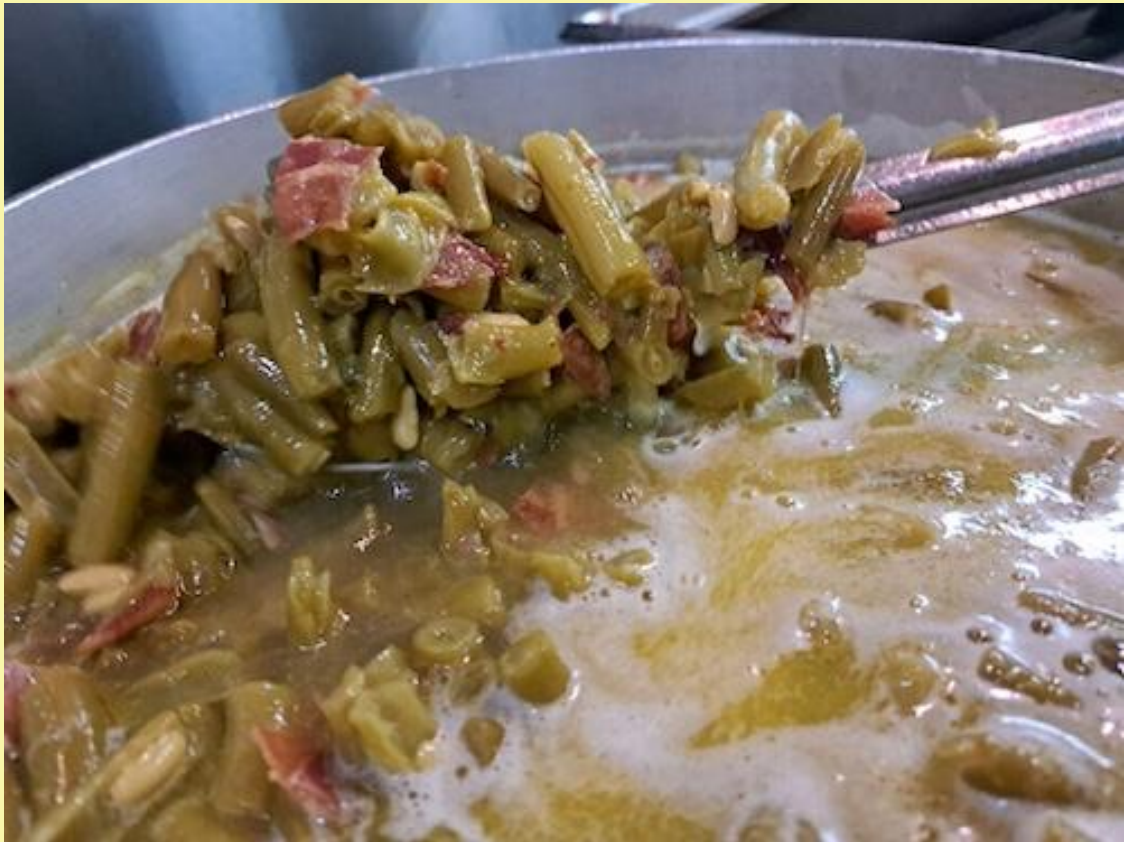
Green Beans and Bacon