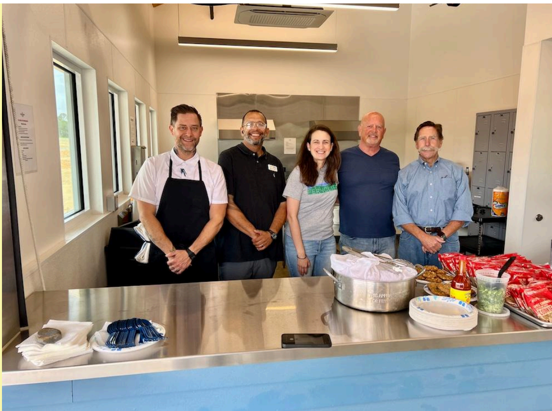
Little Rock Stewpot Volunteer Servers from Second Presbyterian Church