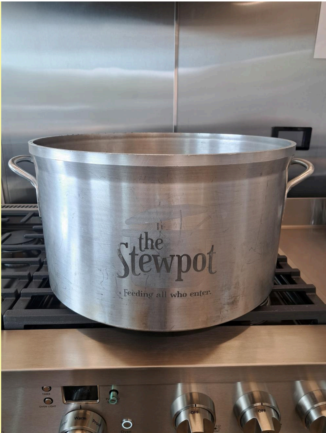
Seven Gallons of Gumbo