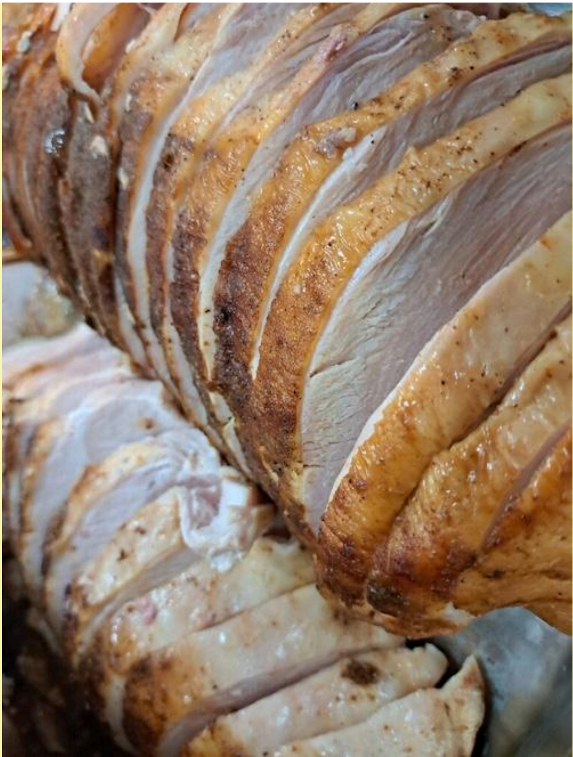
Sliced Turkey Breast