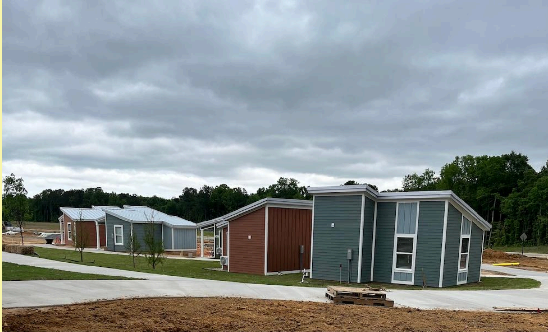
Some of the Little Homes

and rice meal prepared and served by Little Rock Stewpot volunteers.