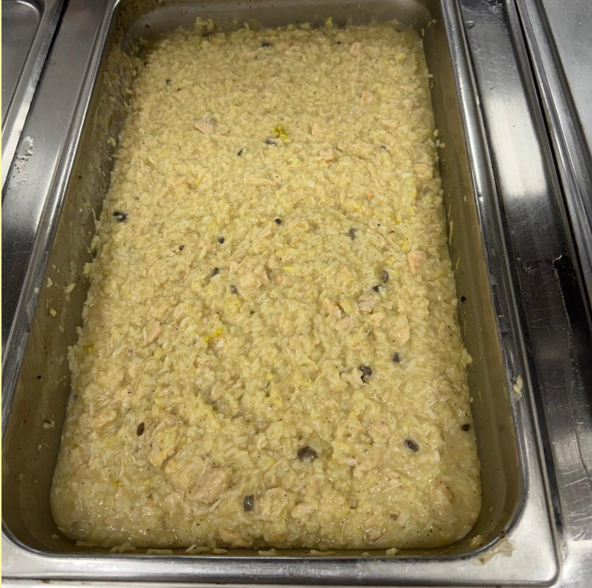
Chicken and Rice