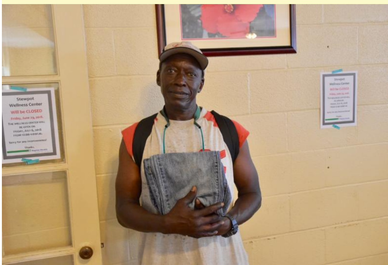
Stewpot Patron with a Pair of Jeans from the Clothes Closet