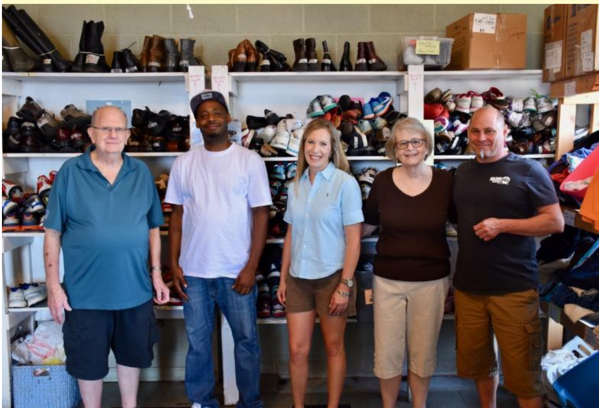
1st Thursday Clothes Closet Team