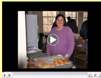
Little Rock Stewpot

To See a short video about the Stewpot, click on the photo below.