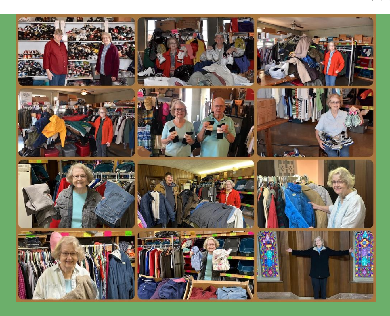
We will miss you!