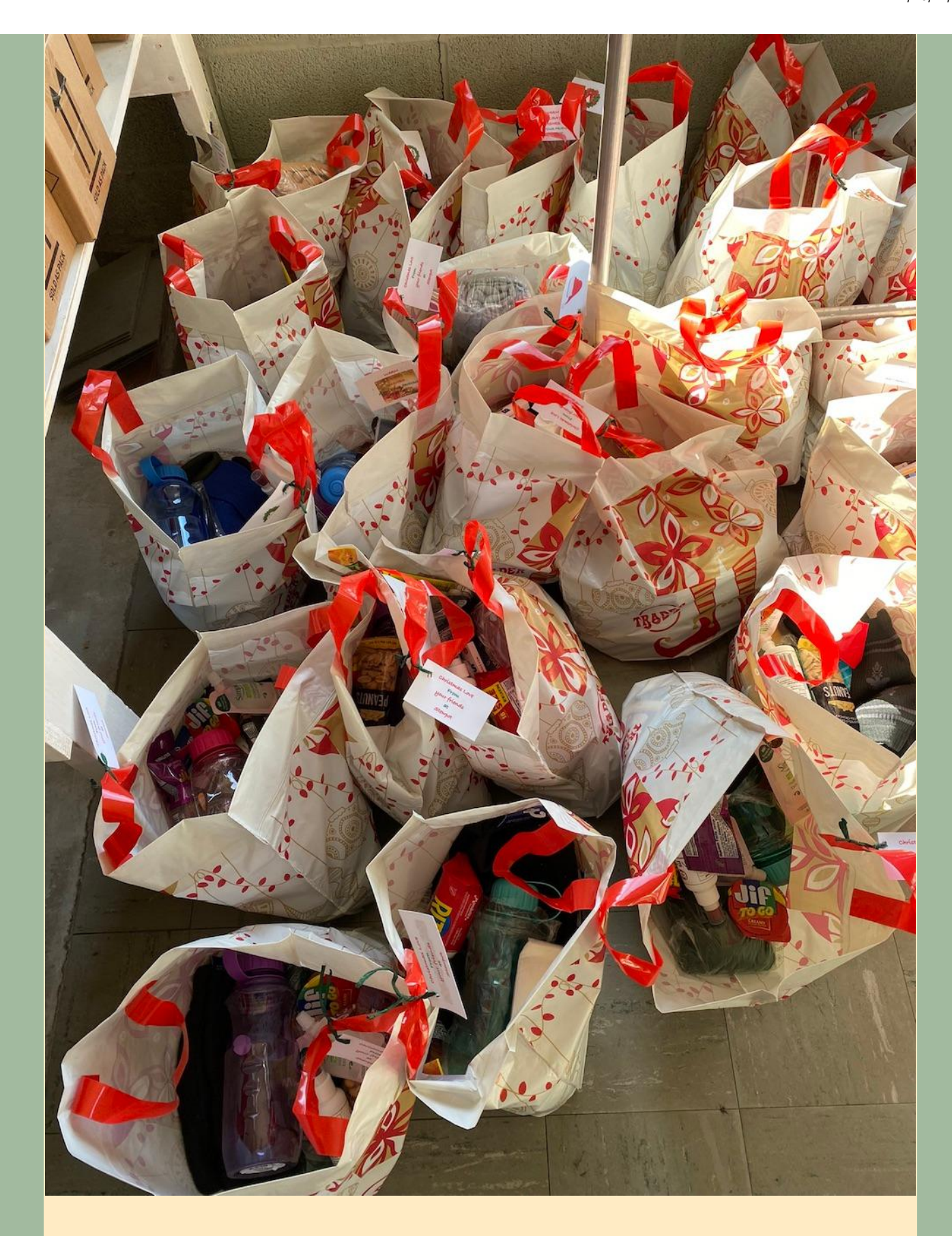
To see a short video with more photos of Stewpot