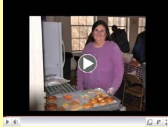
Little Rock Stewpot