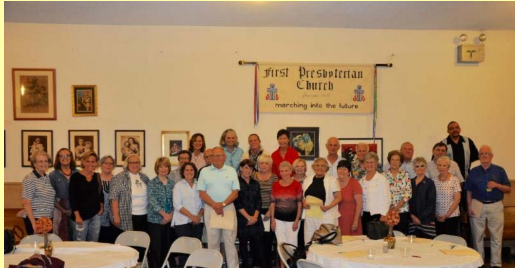
Team Captains and/or their Representatives