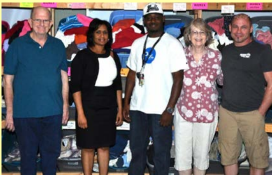
Some of the Clothes Closet Volunteers