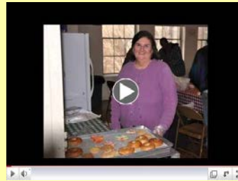
Little Rock Stewpot

To See a short video about the Stewpot, click on the photo below.